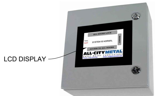
24 VDC CONTROL PANEL